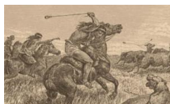
Three Years Slavery Among the Patagonians